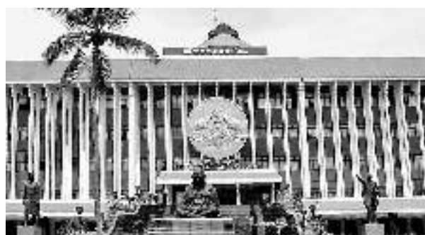
The resolution passed by Kerala Assembly on Thursday says that the VB-G RAM G places a major financial burden on the States.

"VB-G RAM G entails severe financial burden on the States. With its introduction, the rights-based approach that was the essence of the existing (MGNREG) scheme has