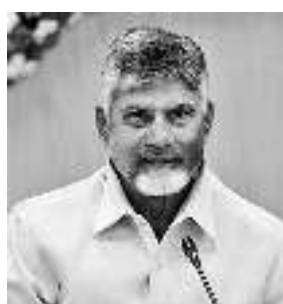
N. Chandrababu Naidu

sadam was compromised during the YSRCP's tenure, he said.